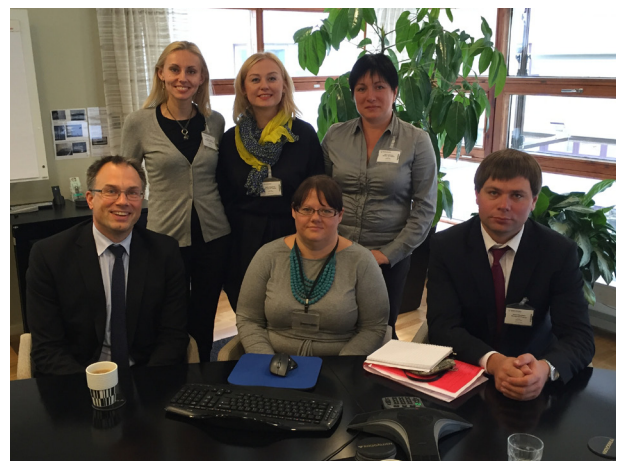
Study visit on State Guarantees, Document Management and Business Process Management, September 22-24, 2015, Stockholm, Sweden

During 2015 were initiated TAIEX events, after realization some of them were developed models of Business process on providing guarantees in Ukraine to improve the procedure of providing state grantees, introduce changes in the document electronic storage in accordance with approved nomenclature of Ministry of Finance, as well prepared draft Law on amendments to the Law of Ukraine "On Accounting and Financial Reporting in Ukraine". Also EU experience is applied for creation of the integrated information-analytical system "Transparent Budget" and developing of the single web portal on public funds using ( http://e-data.gov.ua ). According to the Law of Ukraine "On openness use of public funds" all information will be published in aforesaid portal.