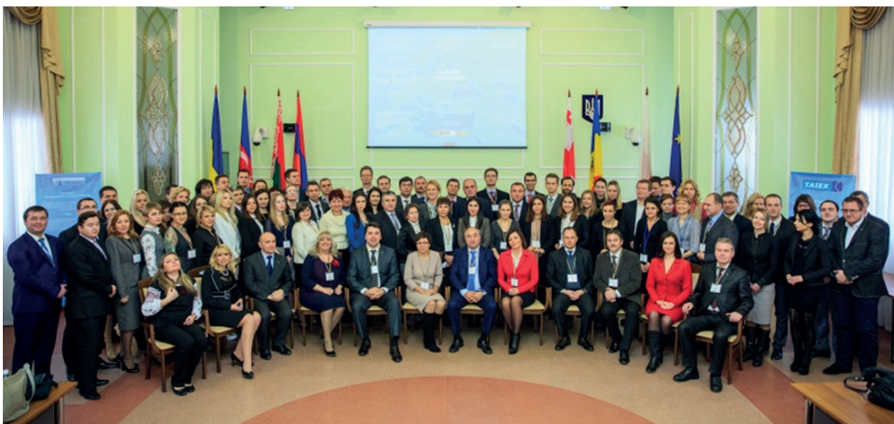
Eighth Annual Regional Conference on Institution Building, November 27 – 28, 2014, Kyiv, Ukraine

Establishment of the continuous cooperation and regular dialog as with projects beneficiary authorities as with the EU Member States and neighbouring countries facilitates the exchange of experience and the best practices in institution building instruments