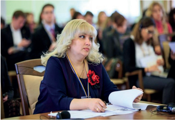
Eighth Annual Regional Conference on Institution Building, November 27 – 28, 2014, Kyiv, Ukraine

implementation, opinions interchange concerning use of its resources, ideas discussion regarding strengthening the future cooperation, promotes better understanding and stimulates common initiatives.