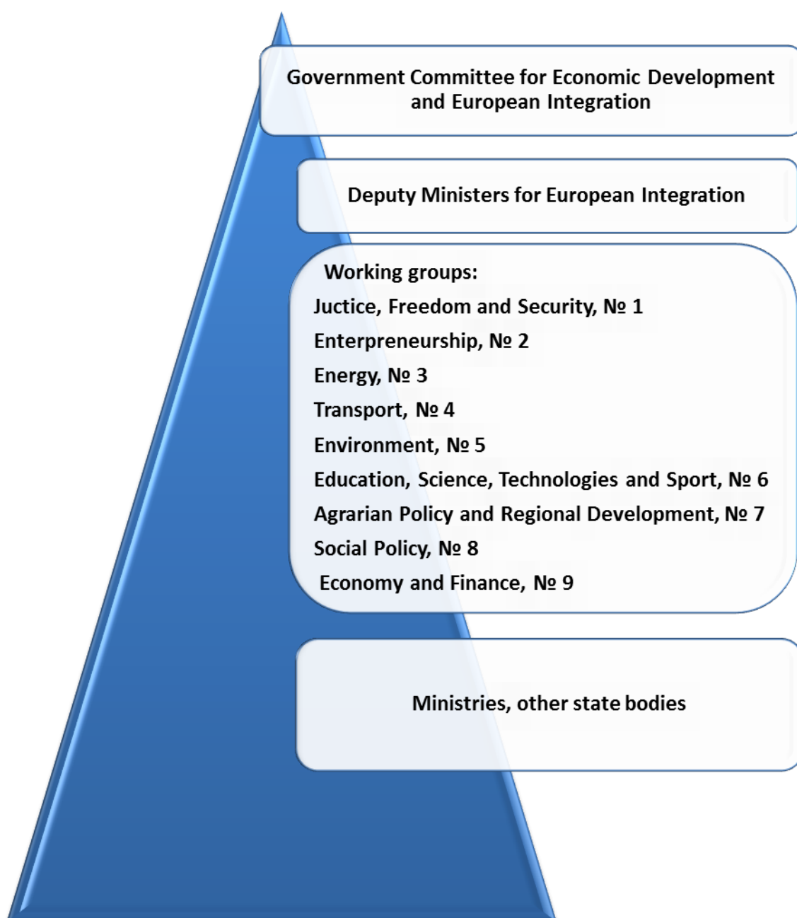
Figure 1 «Implementation of the Agreement: operational level»

In addition, the abovementioned programme will also include a component aimed at attracting and training a new generation of experts in European integration (“new generation cadre”).